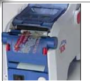
Detects transparent labels