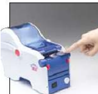
Adjustable sensor position